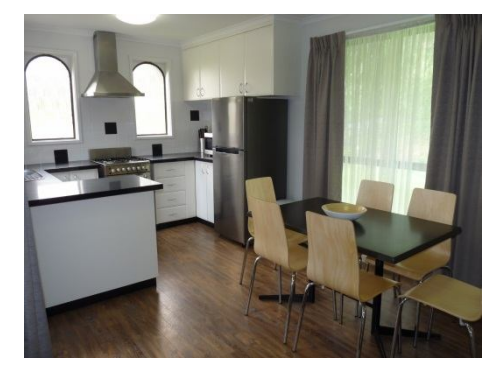
Spacious lounge, dining and kitchens provide abundant space to relax – particularly for longer stays.

Granite kitchens and bathrooms with everything provided.